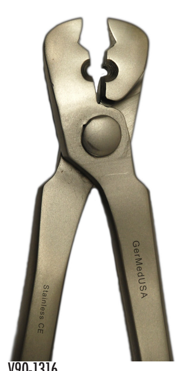
V90-1316 Nail Puller