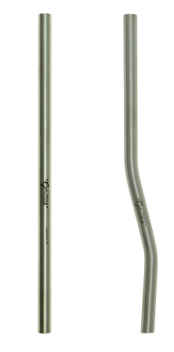
GV70-37 Dental Punch Set of Four, 12.5mm offset, 20mm offset, 20mm Curved, 20mm Straight