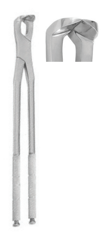
GV70-30 Molar Spreader, 20" Stainless Steel