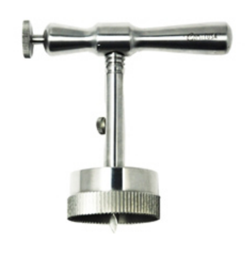
GV70-231 2 Inch Trephine