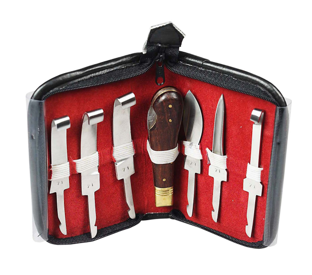
V90-1317 Hoof Knife Kit