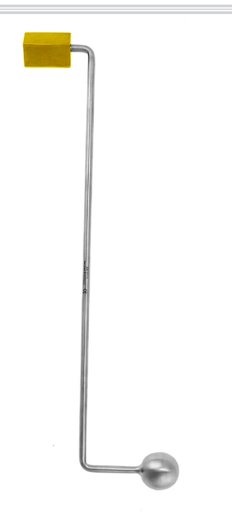
GV70-112 Dental Fulcrum, 3 different height aluminum heads