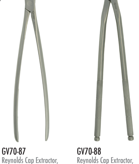
Reynolds Cap Extractor, Lower, 19" Long, Serrated