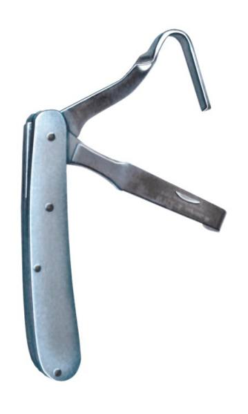
V90-1200B Folding Hoof Knife