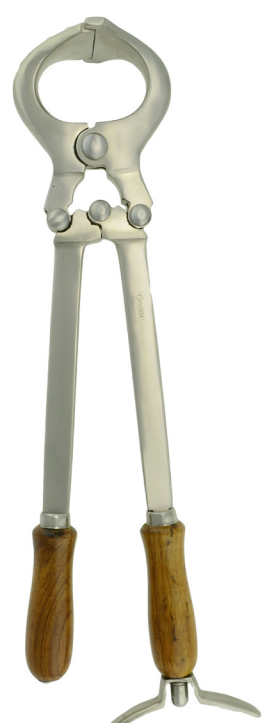
VG605-04 Burdizzo Castrator, Large 15" VG605-05 Burdizzo Castrator, Indian 19"