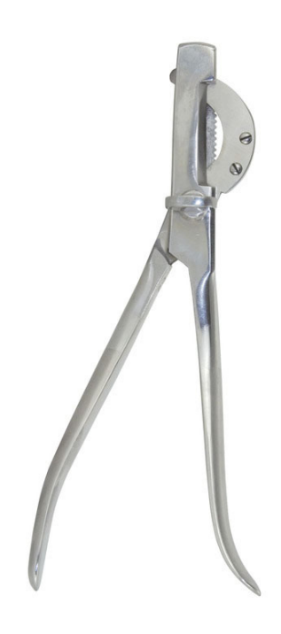
VG602-03 White Emasculator, Stainless German 12"