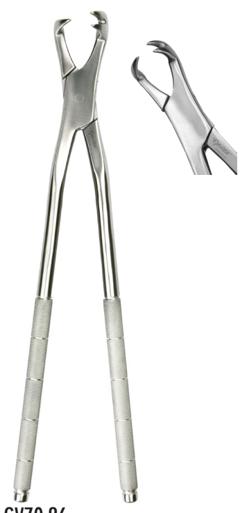
GV70-26 Three Prong Root Forceps, Right, 19"