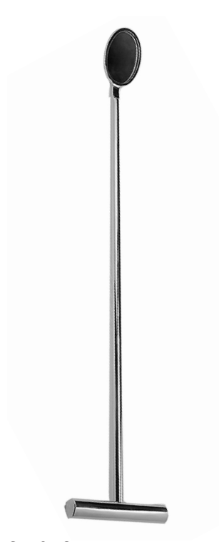
GV70-18 Large Dental Mirror; Oval Head, 16 1/2" Long