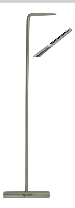
GV70-74 Elevator, 90 degree angle down,