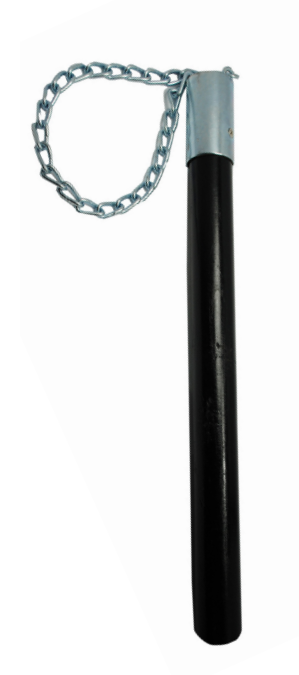
GV70-12 Twitches; 30" Long; Stainless chain twists in both directions