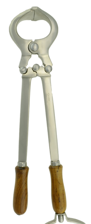
VG605-01 Burdizzo Castrator, Baby 9" VG605-02 Burdizzo Castrator, Small 12" VG605-03 Burdizzo Castrator, Medium, 13"