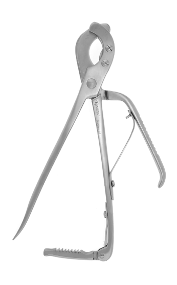
VG601-01 Reimer Emasculator, Serra Modified Emasculator, 12.5"