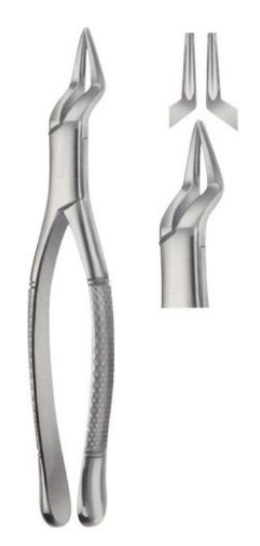
GD50-40 Dental Extracting Forceps, Upper Bicuspids, Incisors and Roots, 286