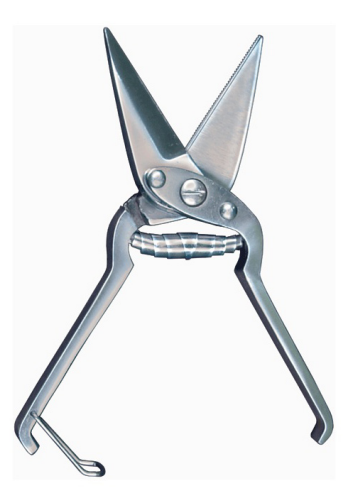
V90-1315 Foot-Rot Hoof Shear