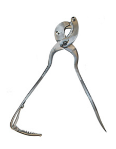
VG604-05 Serra Modified Emasculator, 13.5" with Ratchet