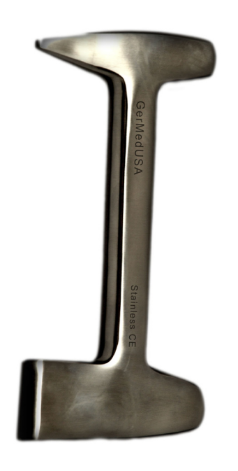
V90-1315A Hoof Buffer