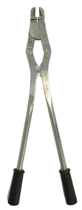
GV70-118 Tooth Cutter, Compound action, Jaw shaped "B", part open jaw, 24" Long