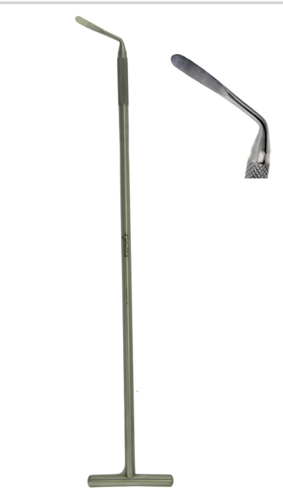
GV70-104 Gingival Elevators, Left