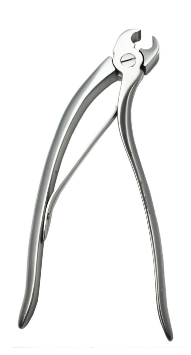
GV70-120 Incisor & Canine Cutter 10"