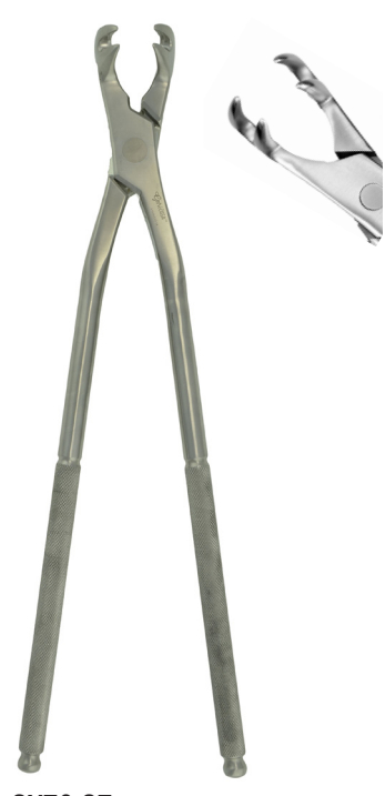
GV70-27 Four Prong Root Forceps, 19"