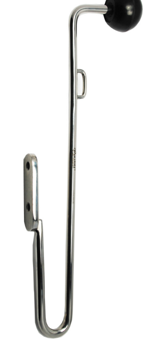
GV70-07 Rubber Mouth Wedge Stainless Steel Plate

GV70-11 Miniature Rubber Mouth Wedge Stainless Steel Plate