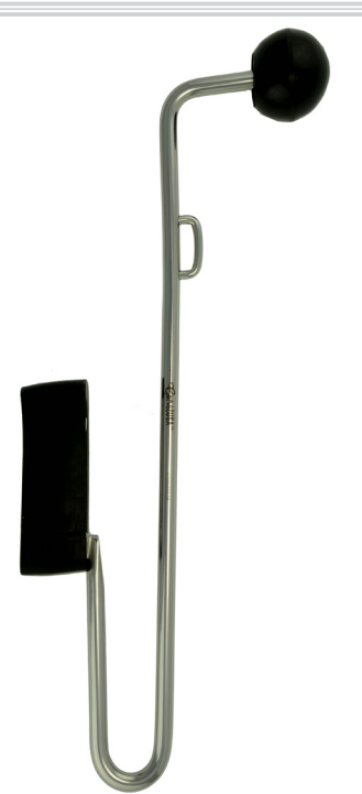
GV70-08 Miniature Pony Size Wedge; 3 1/4" Long, 1 1/4"-1 5/16" Wedge