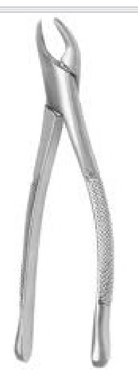
GD50-41 Dental Extracting Forceps, Bicuspids and Roots, Universal, 151