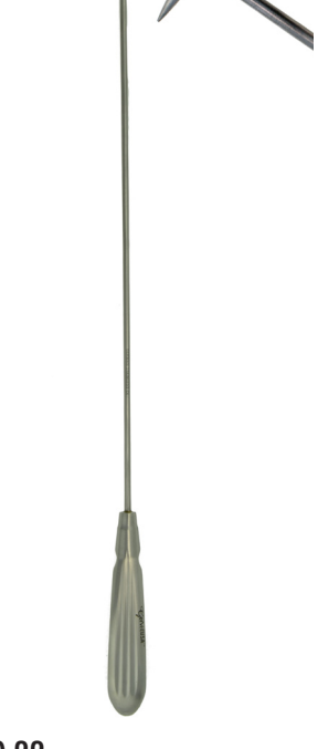
GV70-22 Large Fine Dental Pick 15 3/4" Length, 1 mm Tip Width, 5/8" Tip Depth