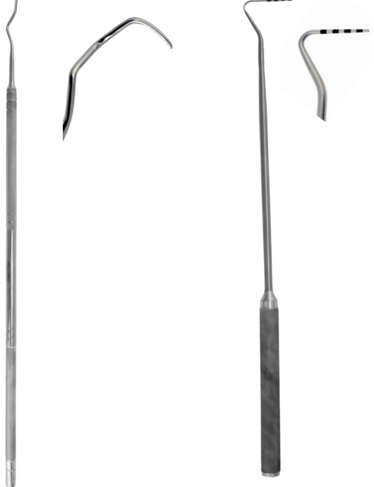
GV70-65 Periodontal Probe, 15 1/2" Long, 3mm, 6mm, 9mm, 12mm, 15mm, 18mm, and 21mm Markings