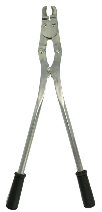
GV70-116 Tooth Cutter, Compound action, Jaw shaped "C", angled head fully open jaw, 24" Long