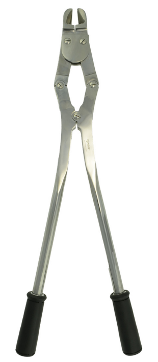
GV70-119 Tooth Cutter, Compound action, Jaw shaped "D", part opened, narrow jaw, 24" Long