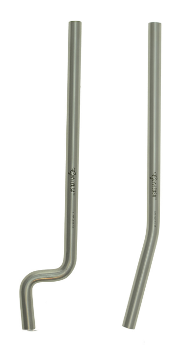
GV70-35 Dental Punch, 8mm Tip, 8" Long, 3/4" Diameter Handle