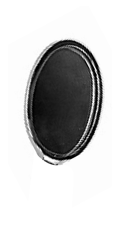
GV70-19 Replacement Mirror with adhesive, oval and round available