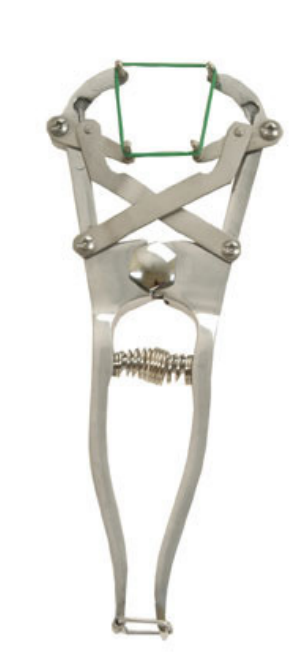
VG600-01 Band Castrator, 10"

G8-105-02 #12 Blades with Large red nylon handle