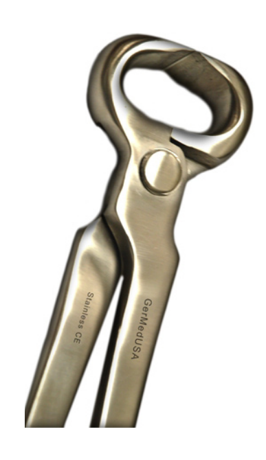
V90-1200A Half-Round Nipper 12"