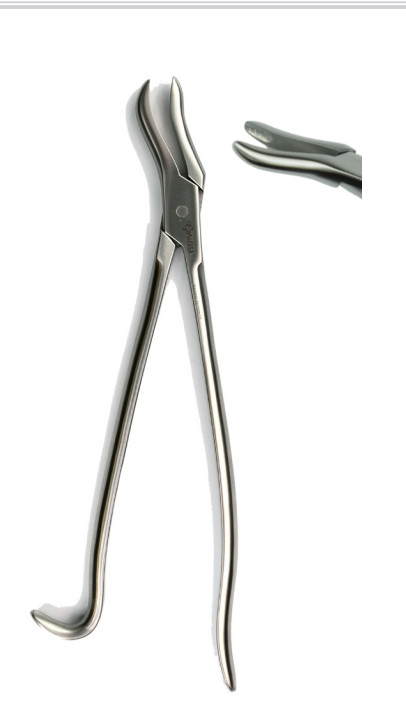
GV70-86 Incisor Forceps, 14"