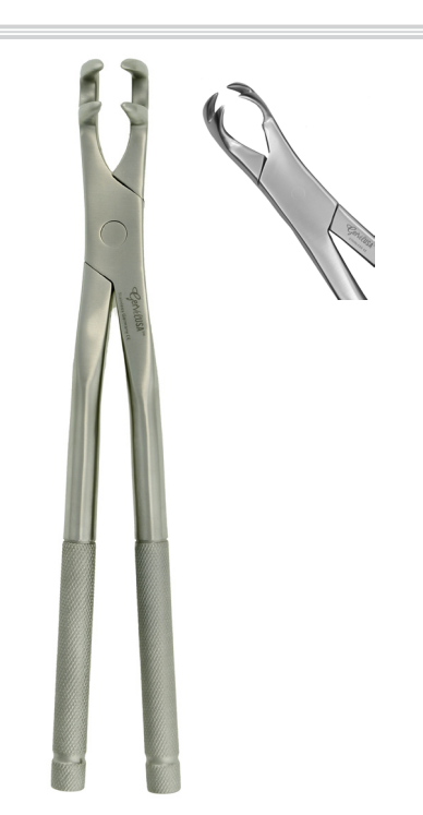
GV70-81 Four Prong Root Pony Forceps, 12"