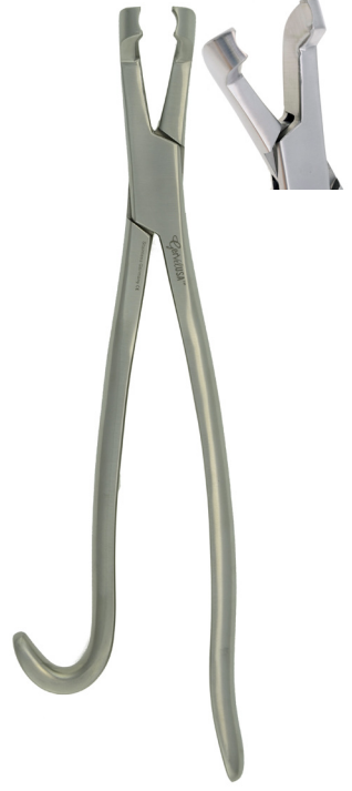
GV70-31 Reynolds Cap Extractor, Upper, 15" Long