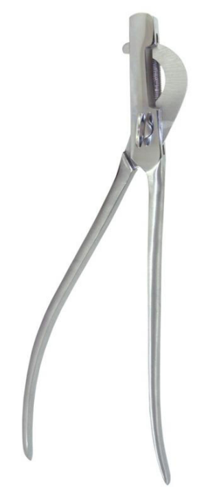
VG604-01 Plain Emasculator, Stainless Steel 12"