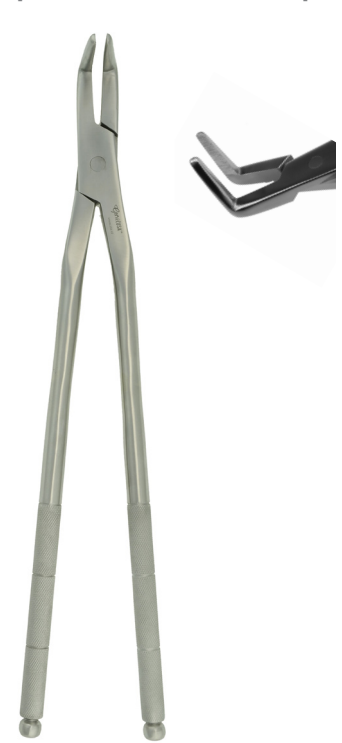
GV70-85 Fragment Forceps, Long Needle, 19"