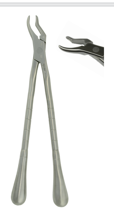
GV70-80 Incisor Forcep, Bulb Handle, 19"