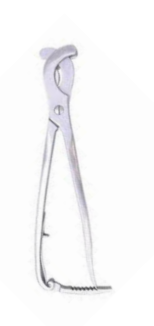
VG601-01A Reimer Emasculator, Regular