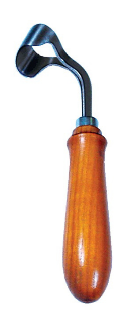
V90-1308 Swiss Hoof Knife