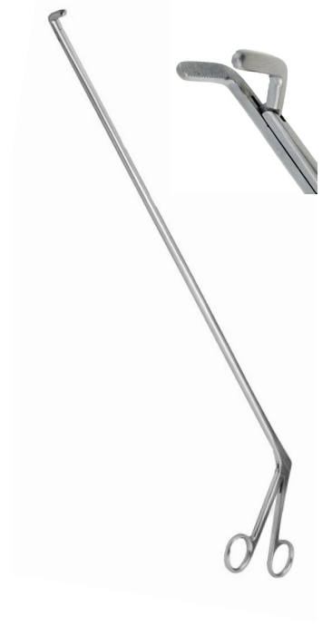
GV70-79 Alligator Forceps, Left, 15"