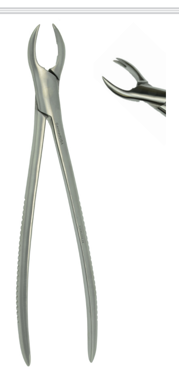
GV70-109 Three Prong Forceps for extracting reminates of pre-molars, 11 " Long