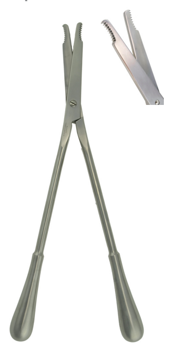
GV70-28 Spreader, 18 1/2", Bulb Handle, Stainless Steel