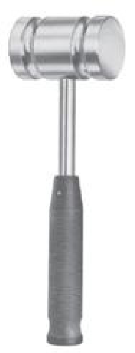
G20-273 Phenolic Heavy Mallet, 11" 2 lbs, 9oz., 45mm Diameter