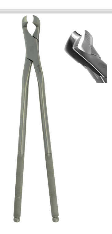
GV70-82 Molar Forceps, Concave, Long Jaw box joint, 19"