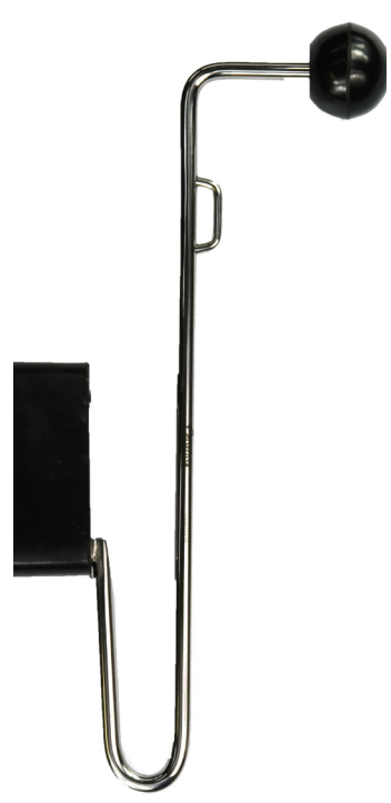
GV70-05 Rubber Mouth Wedge; 3 1/2" Long, 1 1/2"-1 7/8" Wedge