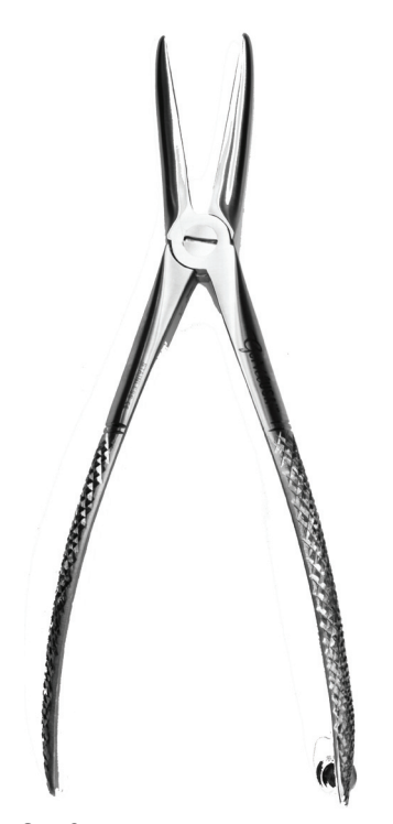
GV70-46 Wolf Tooth Forceps , 7" Long, Stainless Steel