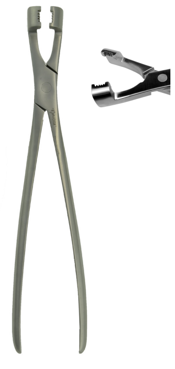
GV70-84 Hewson's Tooth Forceps, 14"