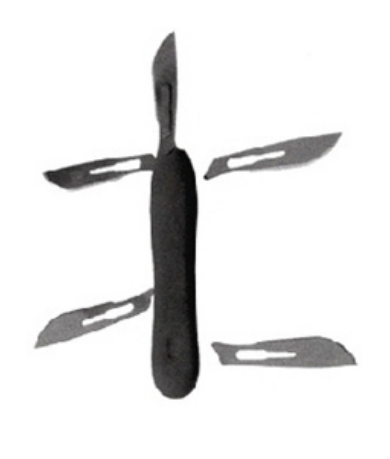
G8-105-01 #22 Blades with Large red nylon Handle

G8-105-02 #12 Blades with Large red nylon handle