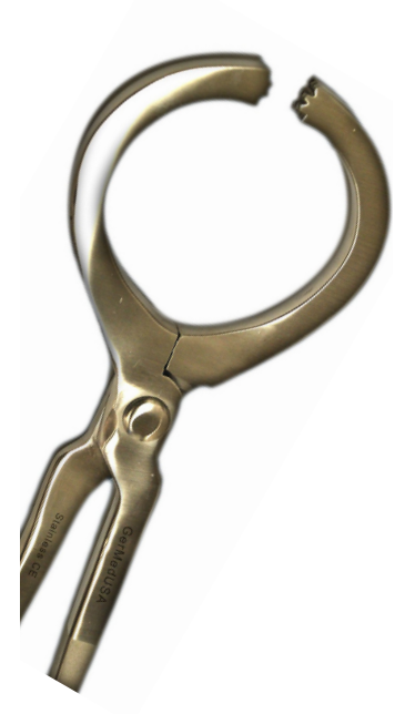
V90-1100 Large Hoof Tester 18" V90-1101 Small Pony Hoof Tester 15"