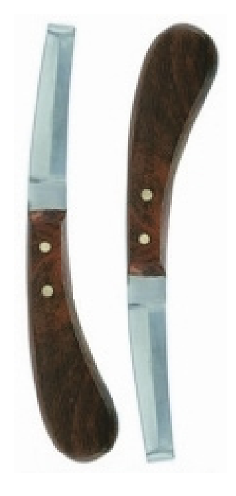
V90-1200 Hoof Knife, Regular