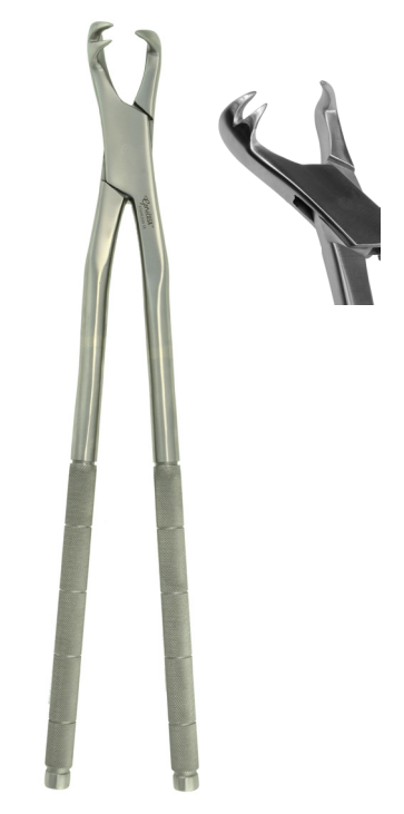
GV70-25 Three Prong Root Forceps, Left, 19"