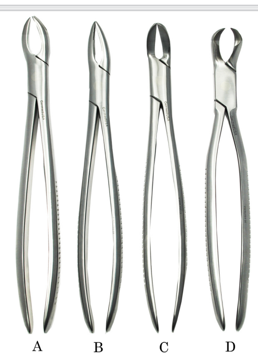
GV70-110 Set of 4 Upper/Lower Separating Forceps, Cow Horned Forceps, Fragment Forceps, and Three prong Forceps