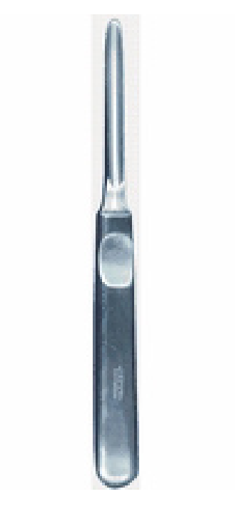
V90-1312 Hoof Searcher