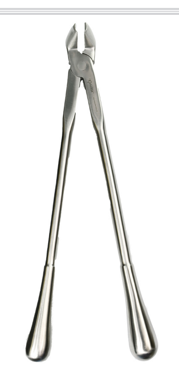
GV70-113 Molar Root Fragment Forceps, 19"