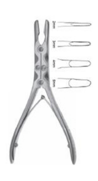
G19-68 Ruskin Rongeur, 7 1/2" Curved 5mm, Double Action