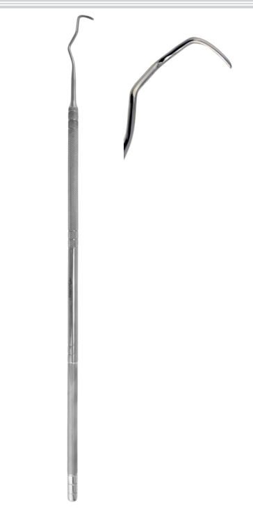
GV70-91 Gracey Curette, 18" Long