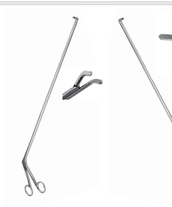
GV70-67 Alligator Forceps, Right, 15"