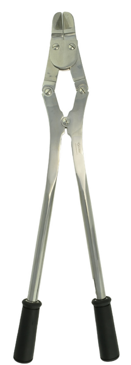
GV70-117 Tooth Cutter, Compound action, Jaw shaped "A", closed jaw, 24" Long