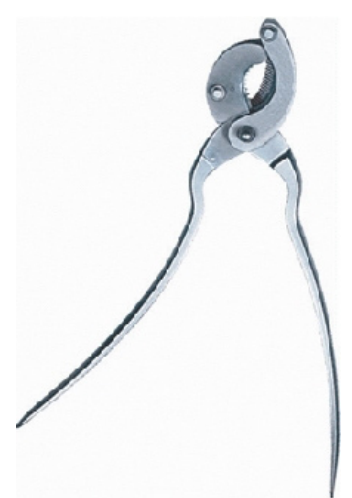
VG604-02 Serra Modified Emasculator, 13.5"