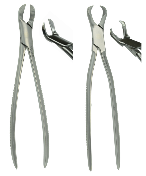
GV70-106 Upper/Lower Separating Forceps For spreading or seperating incisors or wolf teeth before extraction, 10" Long