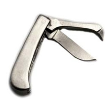
G1502-01 Castrating Knife Spay/Hoe, 3"