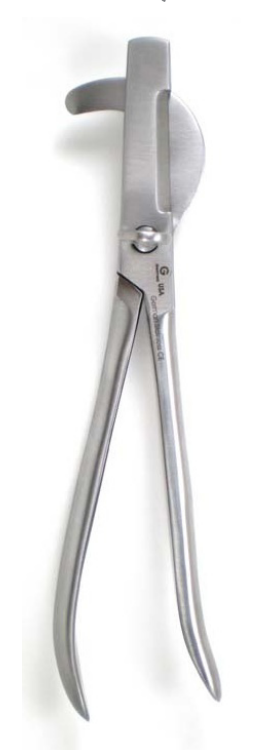
VG603-02 Frank Emasculator, Stainless German 9"