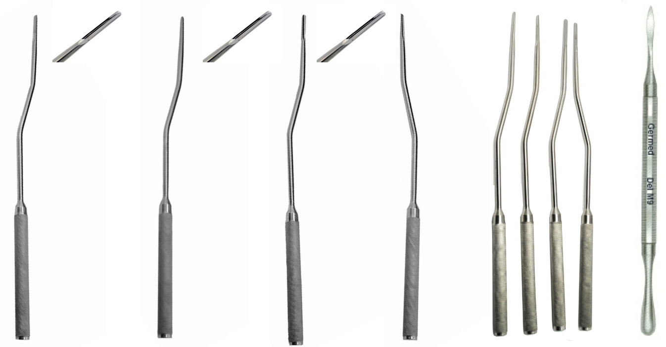
GV70-70 Offset Elevators, Angle Up, 16"

Luxation Elevator, Curved Tip 5mm, 5 3/4"