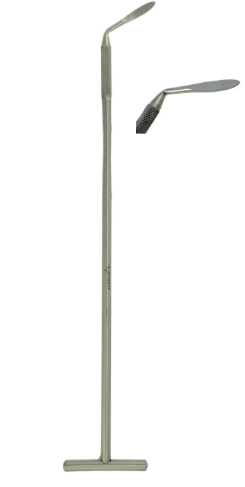
GV70-103 Gingival Elevators, Right